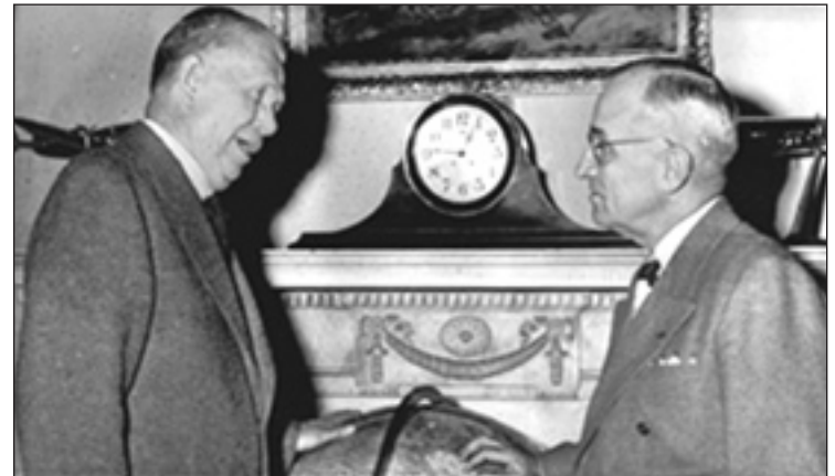
Secretary of State George Marshall speaks with President Harry Truman