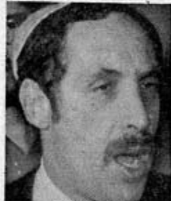
IRV RUBIN Long-standing feud.