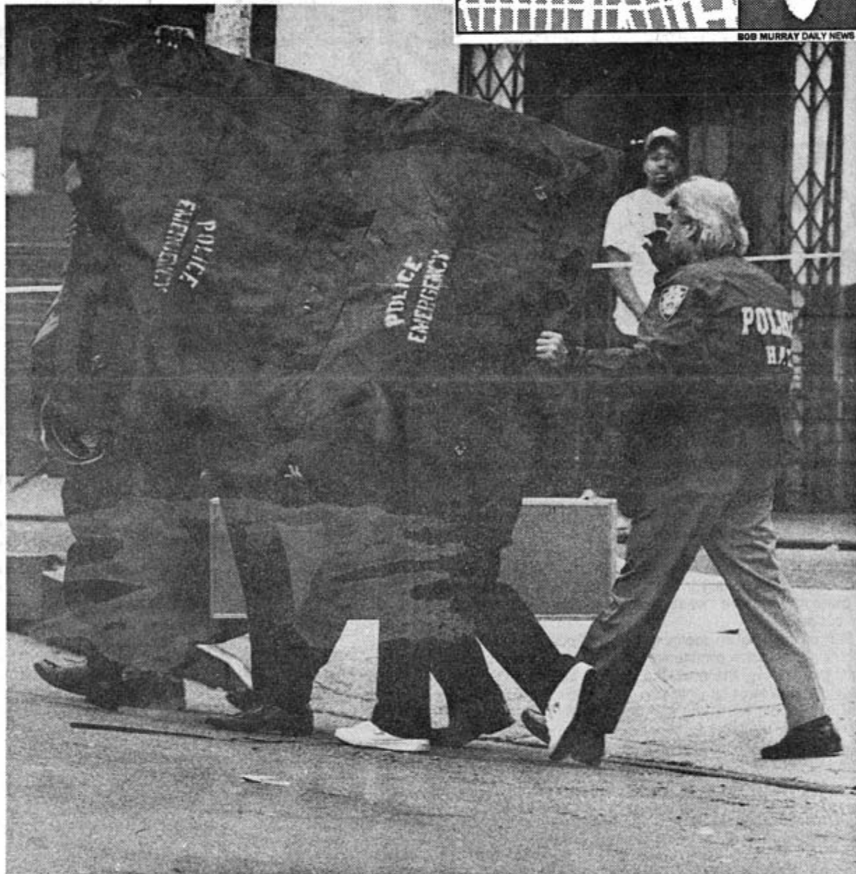
COPS BEHIND SHIELD during a siege on Bleecker St., East Village, yesterday. Leader of militant Jewish group shot a bystander in the incident.

After firing the shots, Levy went back inside the building. The block was sealed off, residents were ordered to stay inside and traffic came to a standstill as scores of cops flooded the area.